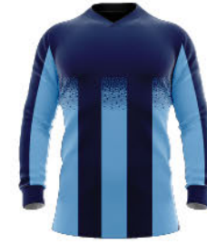
11 HEX ALT STRIPES