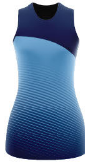
04 BLEND A