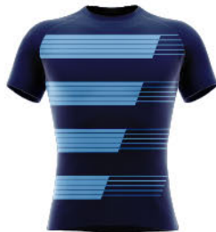
09 SHEAR HOOPS