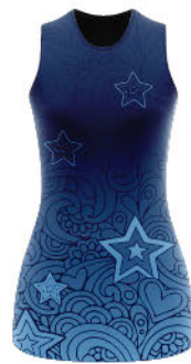
37 DOODLES A