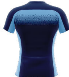
11 HEX PANELS