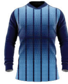
08 HEX STRIPES