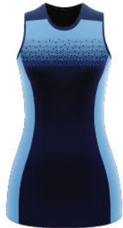
11 HEX PANELS A