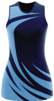
07 CURVES A