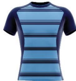
05 BLEND HOOPS