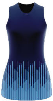
20 YUESAI A