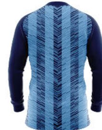
19 INTA STRIPES