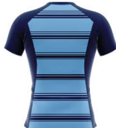
05 BLEND HOOPS