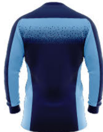
11 HEX PANELS