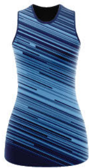
33 FISSURE A