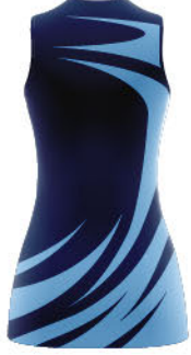
07 CURVES B