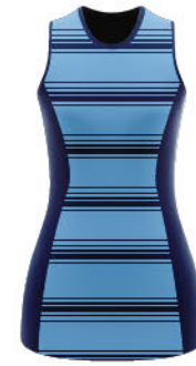
05 BLEND HOOPS A