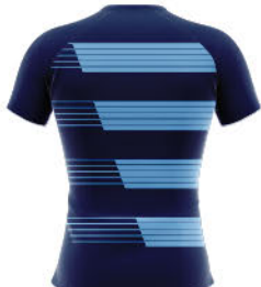
09 SHEAR HOOPS