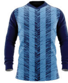
19 INTA STRIPES