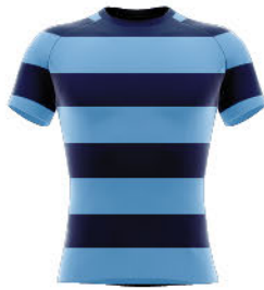
00 PLAIN HOOPS