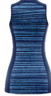
15 OSPREY B