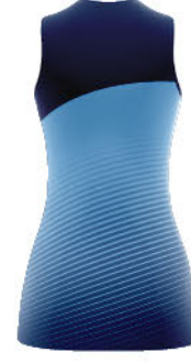
04 BLEND B