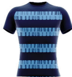
10 VERT HOOPS