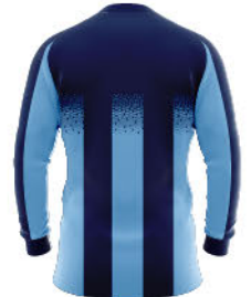
11 HEX ALT STRIPES