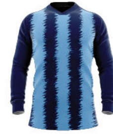
01 REVERB STRIPE