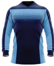
11 HEX PANELS