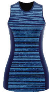
15 OSPREY A