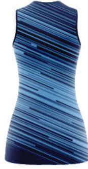
33 FISSURE B