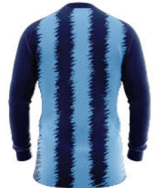
01 REVERB STRIPE