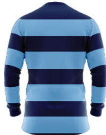
00 PLAIN HOOPS