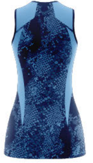
38 SERPENT B