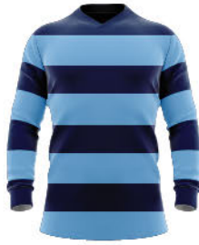
00 PLAIN HOOPS