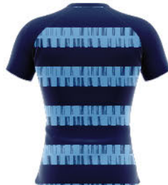
10 VERT HOOPS