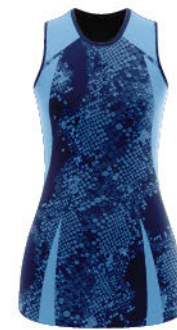
38 SERPENT A