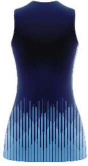
20 YUESAI B