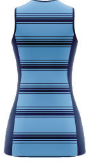
05 BLEND HOOPS B