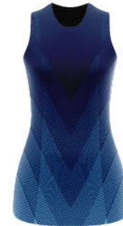
39 SQUEEZE A