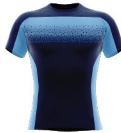
11 HEX PANELS