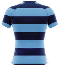
00 PLAIN HOOPS