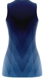
39 SQUEEZE B