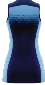
11 HEX PANELS B