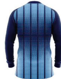
08 HEX STRIPES